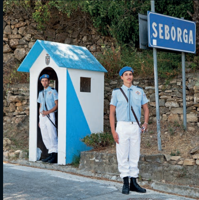
Clockwise from top left The Principality of Sealand can only be entered by winch; the border of Saugeais, a faux-country that was started as a joke in the 1940s; the distinctive blue-and-white branding of the town of Seborga, which claims to be independent from Italy; Elleore, off the Danish island of Zealand, which evolved from a children's summer camp